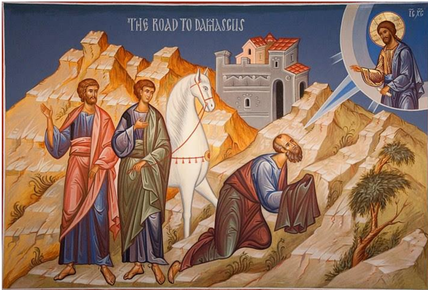
Christophany The Road to Damascus